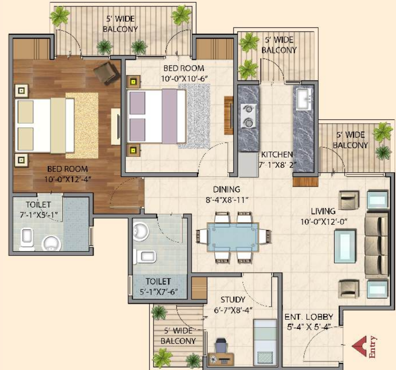
SUPER AREA - 1175 SQ.FT. TYPE-II B 2 BHK+2 Toilet+Study Block-B, C