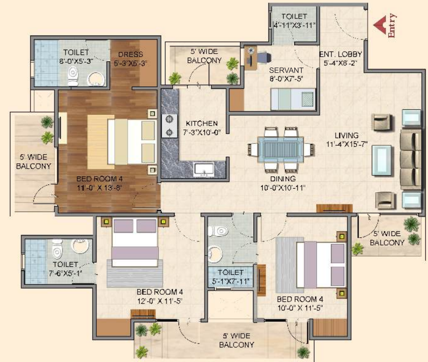
SUPER AREA - 1800 SQ.FT. TYPE-V 3 BHK+4 Toilet+Servant Block-B,C