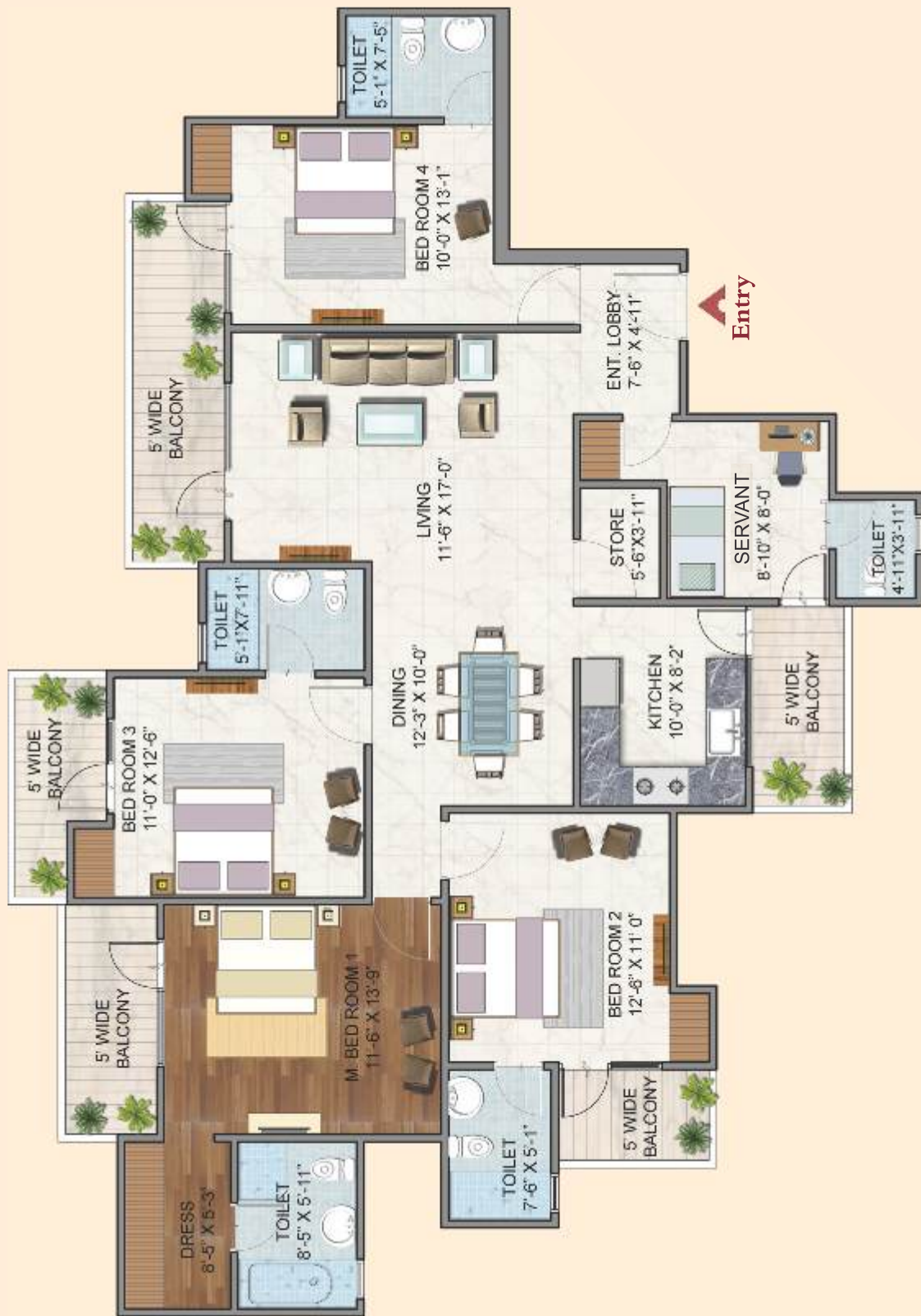
SUPER AREA - 2300 SQ.FT. TYPE-VI 4 BHK+5 Toilet+Servant+Store Block-F