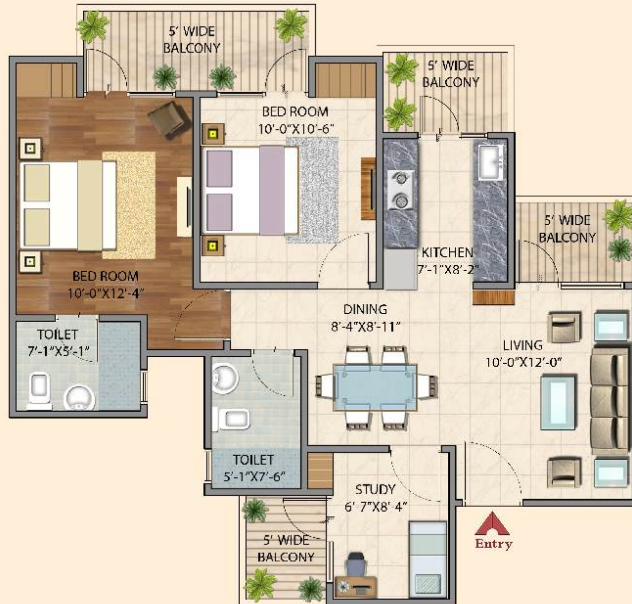
SUPER AREA - 1150 SQ.FT. TYPE-II A : 2 BHK+2 Toilet+Study Block - A, D, E, G