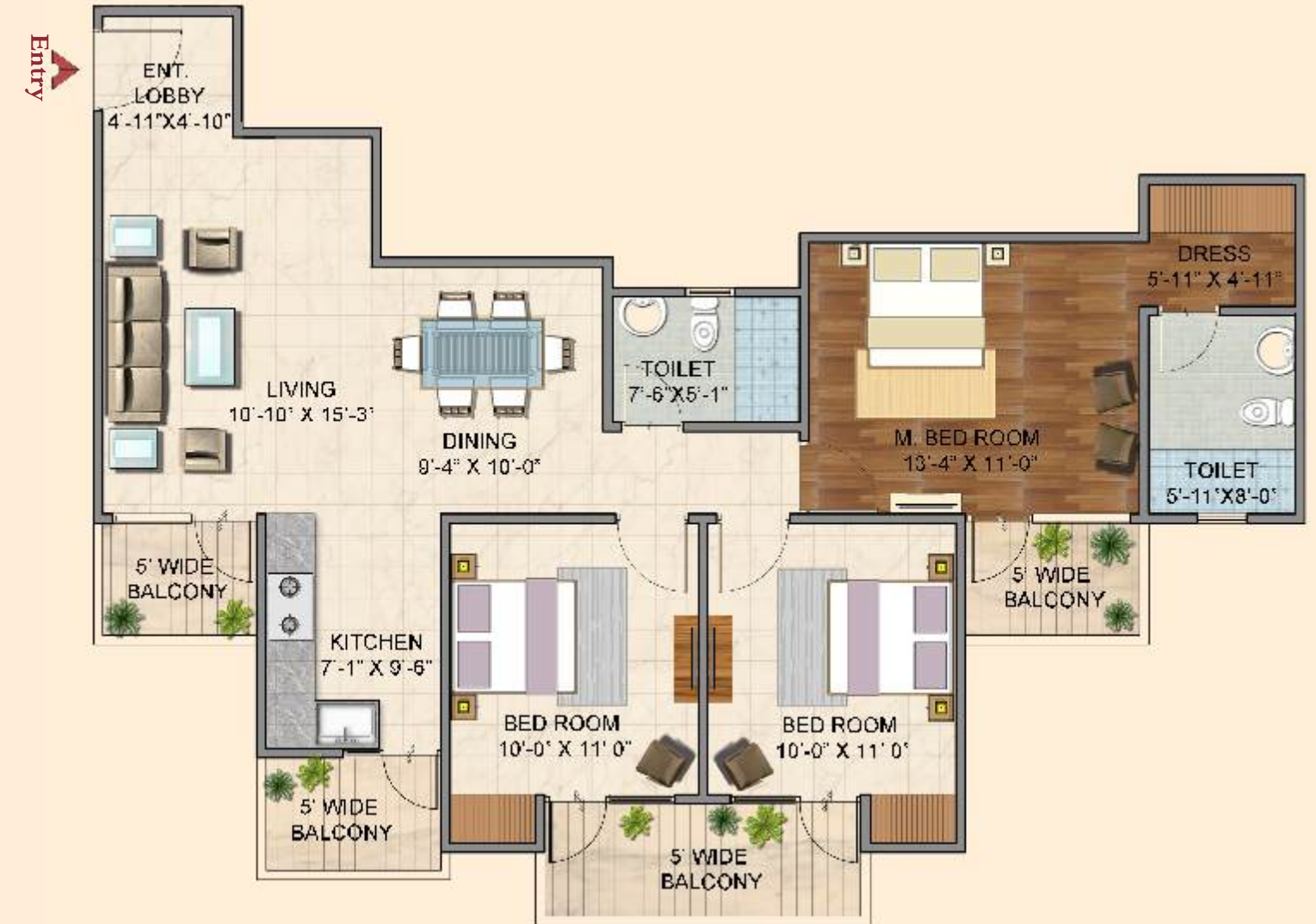
SUPER AREA - 1450 SQ.FT. TYPE-III B 3 BHK+2 Toilet Block-F