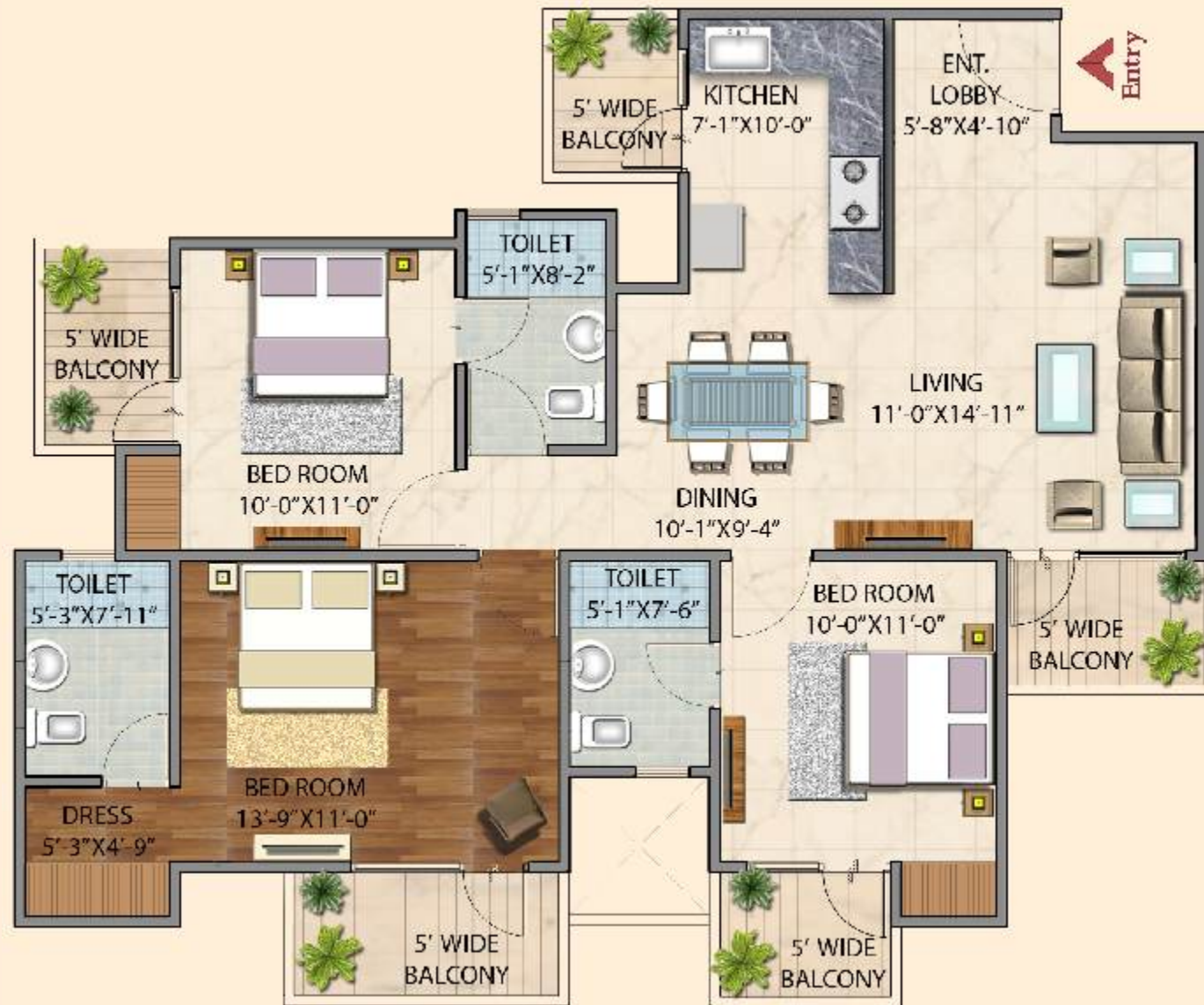
SUPER AREA - 1530 SQ.FT. TYPE-IV 3 BHK+3 Toilet Block-F