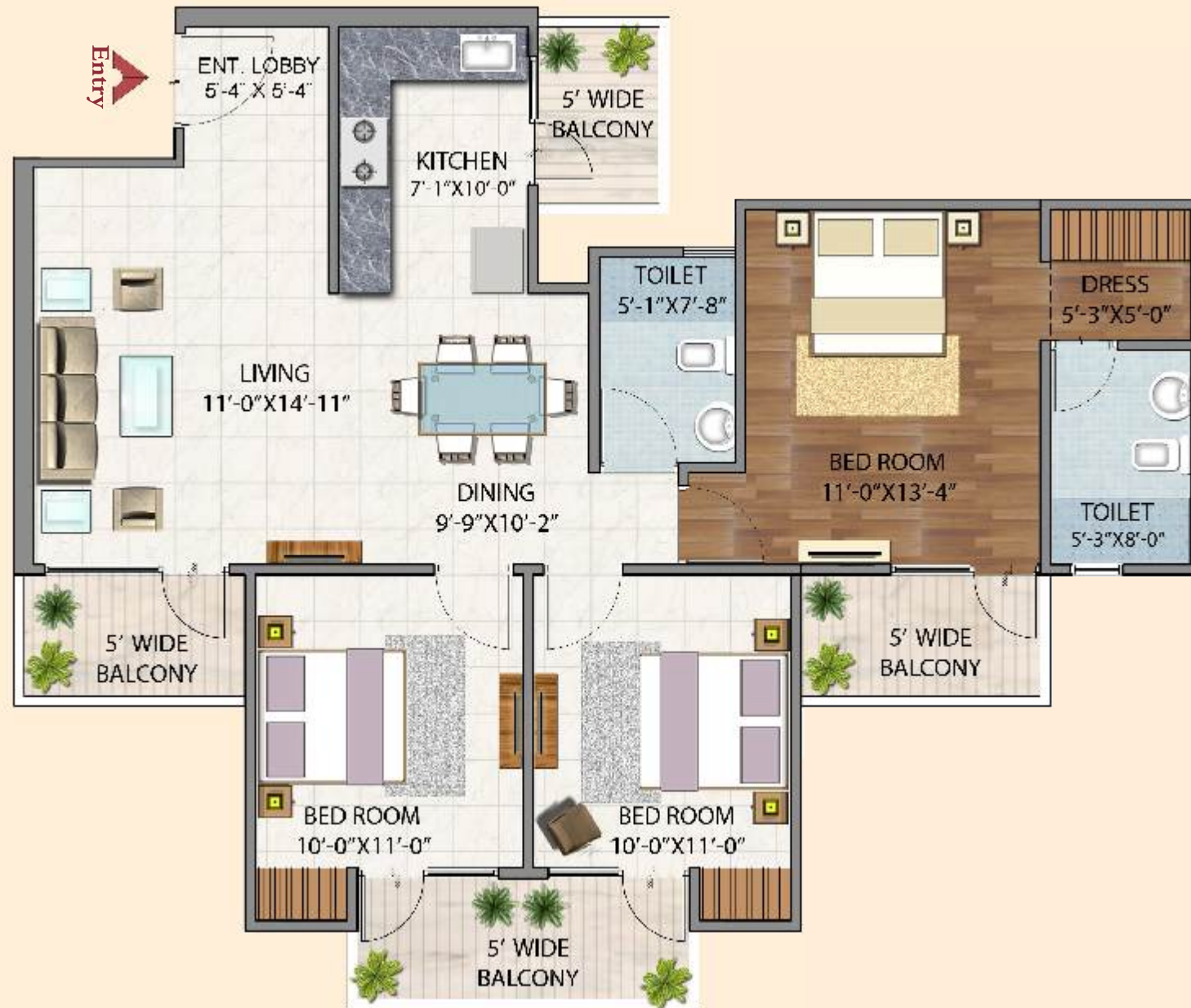
SUPER AREA - 1450 SQ.FT. TYPE-III A 3 BHK+2 Toilet Block-B, C